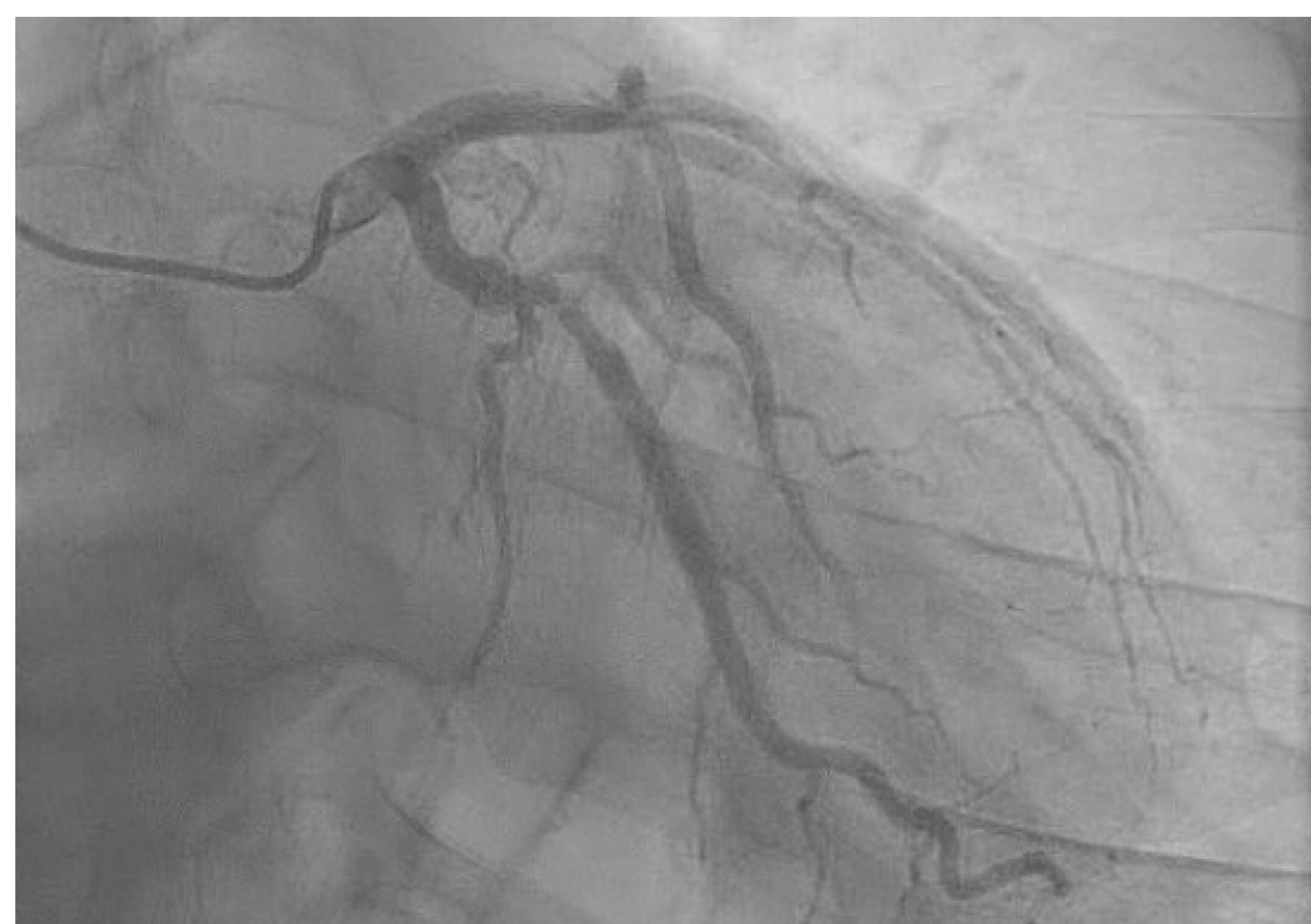
Figure 2: Coronary Angiography with high grade Left circumflex stenosis.